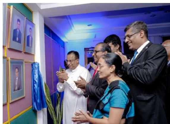
Past President's Portrait Unveiling